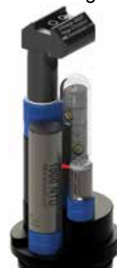
UV•Xchange installed on Metrec•X endcap. Configured to protect conductivity, turbidity, and pressure sensors.

Install UV•Xchange on a Metrec•X or Smart•X for a high performance in-situ CTD. By eliminating biofouling-induced drift, UV•Xchange allows sensors to perform to their full potential for the duration of long-term, in-situ deployments. Like all other members of the Xchange™ suite of products, UV•Xchange is field-swappable and easily configured to fit the needs of any operation. Installed directly on the end cap of an X-Series instrument, the module can be set to various positions, enabling optimal coverage of all sensors requiring protection. UV•Xchange can also be installed on Micro•X as a standalone option for other instrumentation. When used in applications with limited power supply, UV•Xchange can be wired independently from the sensor load to optimize the power budget.