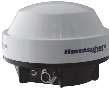
Figure 1-1: A325 smart antenna

Note: Throughout the rest of this manual, the A325 Smart Antenna is referred to simply as the A325.