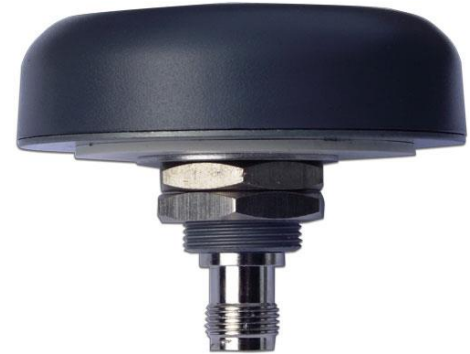
TW3xxx Dimensions (mm)

The TW3892 is housed in a through-hole mount, weather-proof enclosure for permanent installations. L Bracket or Pipe Mount (part numbers 23-0040-0, 23-0065-0 respectively) are available for non-rooftop installation. A 100mm ground plane is recommended for non-roof-top installations.