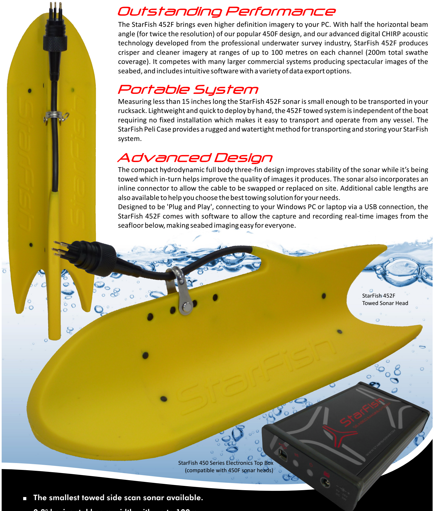
StarFish 452F Towed Sonar Head

Designed to be 'Plug and Play', connecting to your Windows PC or laptop via a USB connection, the StarFish 452F comes with software to allow the capture and recording real-time images from the seafloor below, making seabed imaging easy for everyone.