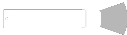
Directional (e.g. 1133H)