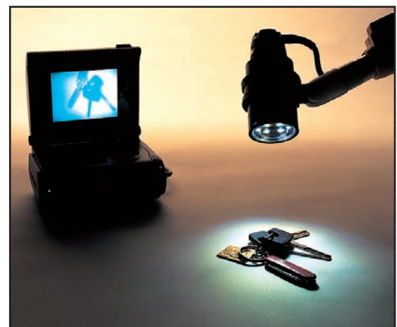
Super SeaSpy showing size

As with all Tritech cameras the Super SeaSpy is fitted with a high quality water corrected viewport to optimise the picture quality. This water corrected viewport results in a camera that provides a crisp picture during close proximity viewing in murky water.