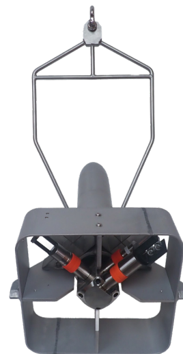
Free-fall tow body; multiple configurations and sizes available.

For other options, please contact AML Oceanographic directly.